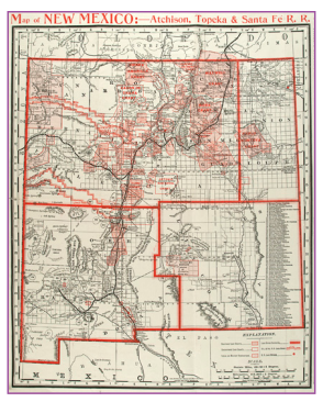
An 1893 map of New Mexico by the Atchison, Topeka and Santa Fe Railroad. Lithograph, Chicago: Rand, McNally and Co., Printers. Fray Angélico Chávez History Library NMHM, Map Collection 78.9 Pa 1893.

The Fray Angélico Chávez History Library at the New Mexico History Museum has won a $179,600 grant from the Council on Library and Information Resources to catalog its map collection, a threeyear effort that will help researchers and the public